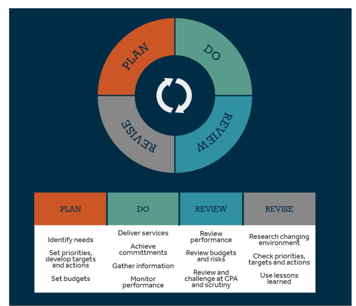
*CPA: Corporate Performance Assessment

We take a systematic approach to performance management, following the industry-recognised 'plan-do-review-revise' cycle.